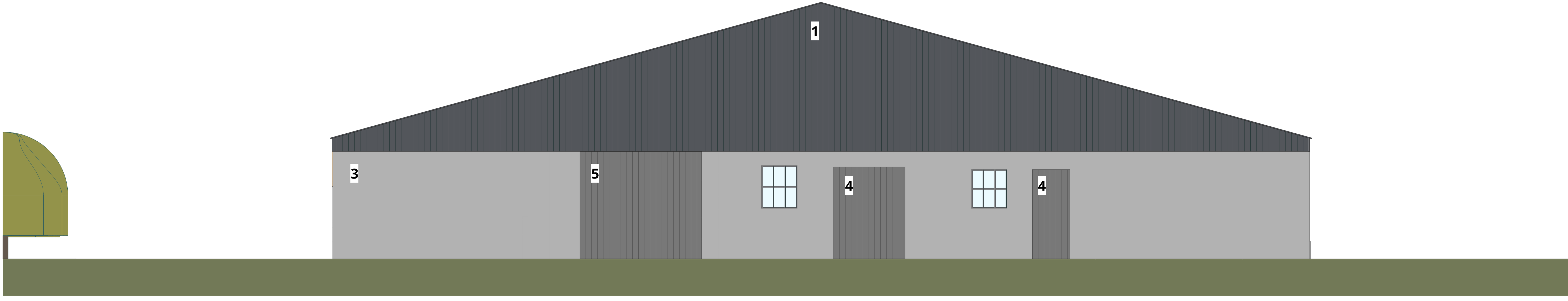
West - As Existing 1 : 50